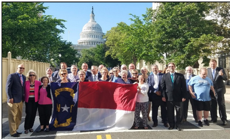
Industrial Opportunities, Inc. (IOI) joined MARC, Inc., in sponsoring a “North Carolina Day on the Hill,” at the Capitol in Washington, DC

On Tuesday, May 16, 2017, MARC members from across North Carolina, self-advocates and their family members gathered at the Capitol to educate their members of Congress. During their Day on the Hill, the North Carolina advocates met with seven Members of Congress and legislative staff to tell their stories and express their concerns about current laws and regulations that limit or restrict government supports for services and employment options. Family members and self-advocates expressed strongly the need for legislation that ensured personal choice from an array of options and opportunities.